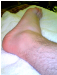
A Painful Swollen Joint

In PR Cases; some will burn itself out, some will remain as PR and over 50% will go on and develop RA or another form of Arthritis.