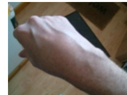
Pain Reaching OUT

The IPRS offers free online advice and a support group run by other PR members who can help you come to terms with your diagnosis and help you through the pain. Don't suffer alone when help is only a click away.